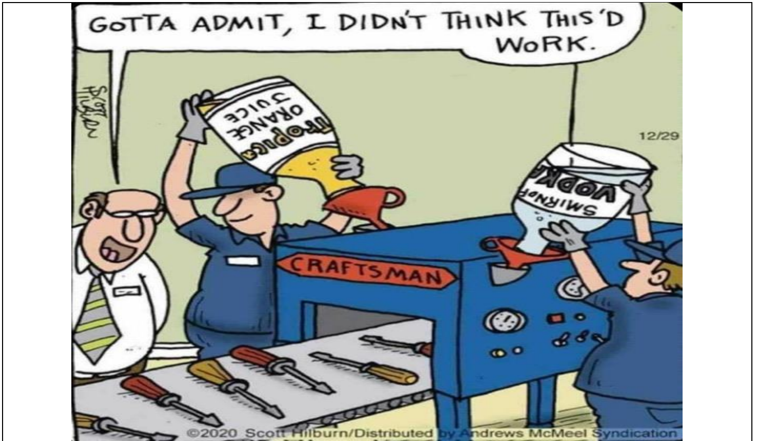
Bonus Comic for July